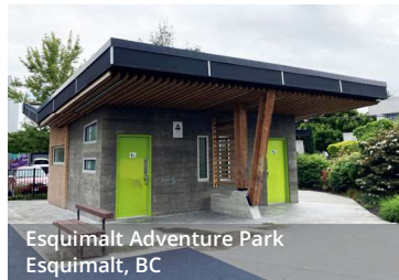
Esquimalt Adventure Park Esquimalt, BC

Inspiration: Inclusive washroom building