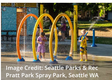
Pratt Park Spray Park, Seattle WA

Inspiration: Gathering space for individuals and groups